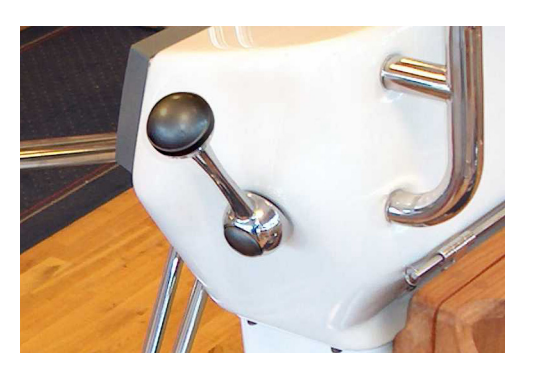
shown without cover plate