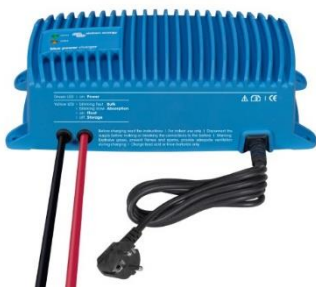
Blue Smart IP67 Charger 12/25