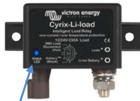
LED status indicator