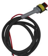
Control cable for Cyrix-ct 12/24-230 Length: 1 m