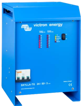
Skylla TG 24 50 3 phase

To learn more about batteries and charging batteries, please refer to our book 'Energy Unlimited' (available free of charge from Victron Energy and downloadable from www.victronenergy.com ).