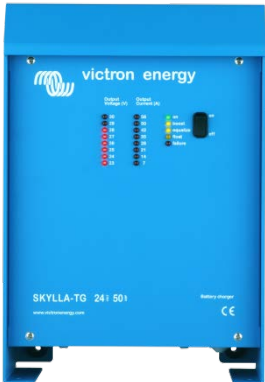
Skylla TG 24 50