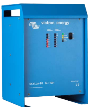
Skylla TG 24 100